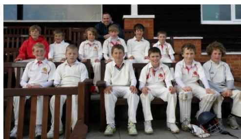
That was then .....